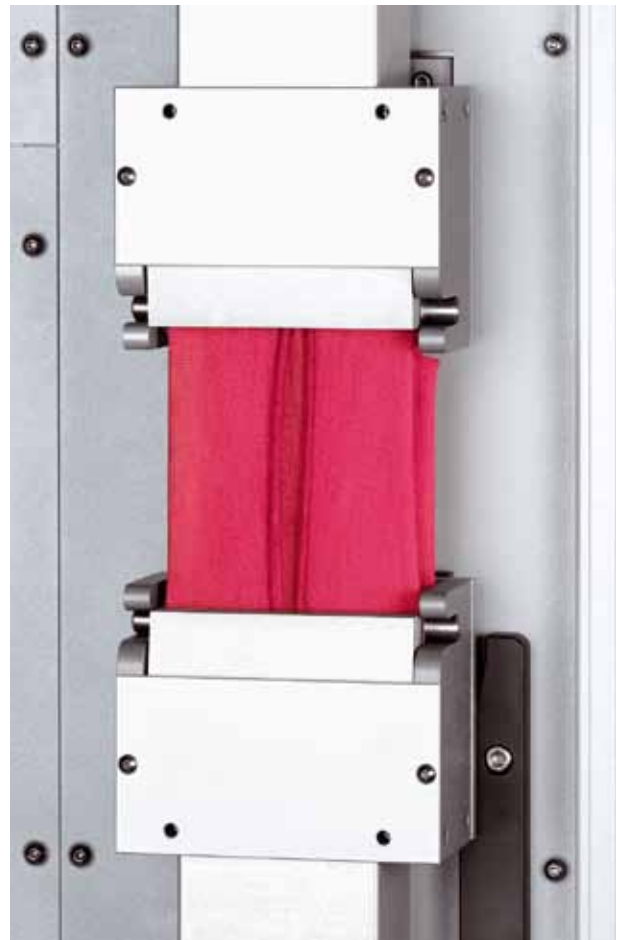
Clamp for knitted fabrics

For testing of the elastic behaviour of woven fabrics containing elastanes pneumatic clamps with special jaw faces are available, too.